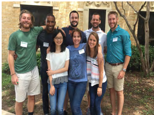
2017-2018 Cohort at Orientation Day