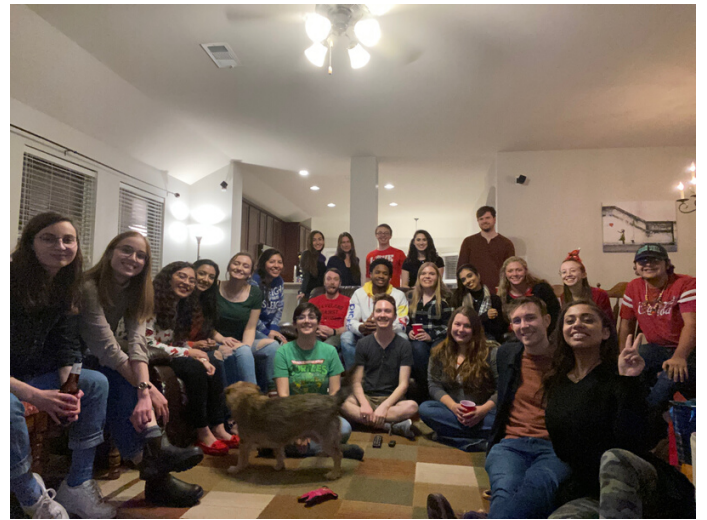
Pictured: Teen STar Lab