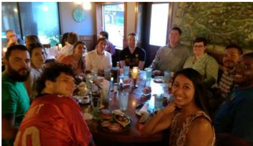
L: BSci Student Welcome Dinner at Green's Restaurant, August 2015

Student Happenings: Get to know some of our Experimental and BSci students through their achievements!